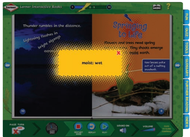
Lerner Interactive Book interactive glossary.

Lerner Interactive Books lend themselves perfectly for teaching vocabulary during any size group or individual lesson. Before you introduce a new title identify all content area and challenging words by underlining or highlighting them with the pen and highlighter tools. Using the audio feature, click on each word to model the correct pronunciation to present each new vocabulary word to the class. Tell the class the definition of each word by using the built-in glossary (when applicable). Use each vocabulary word in a sentence to clarify and reinforce its meaning. Then ask students to come up with their own sentences using the new vocabulary words. By taking an active part in figuring out the meaning of the word, students have a better chance of retaining the meaning and growing their vocabulary.